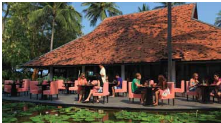
Chef Manao Restaurant

A truly dedicated traditional Thai restaurant featuring flavours and spices from all regions of the Kingdom. The kitchen brigade emphasizes using local ingredients as well as herbs and vegetables from our own gardens.