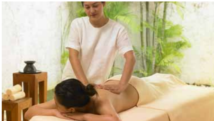
Six Senses Spa