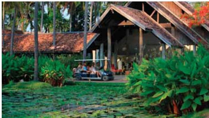
Chill by the Pond