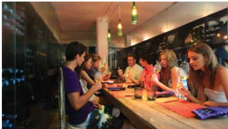
The Wine Cellar

Chef Manao Restaurant opens only for dinner, is air conditioned, but also offers al fresco options for those who prefer to dine in the balmy tropical air overlooking splendid lotus ponds.