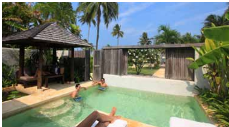
Evason Pool Villa

A unique feature of the studios is an oversized terrace complete with outdoor furniture, sheltered from the weather with a canopy and mosquito net, which makes it possible to sleep under the stars during balmy tropical nights.