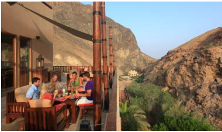
At The Springs