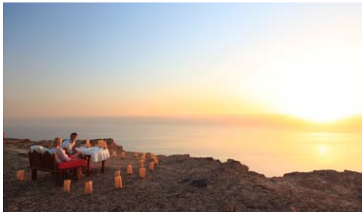
Sun Set at Dead Sea