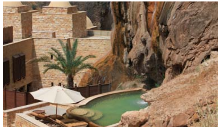
Six Senses Spa