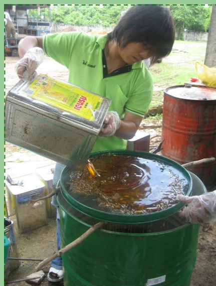
Filtrate used cooking oil before start extract biodiesel