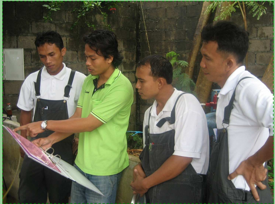
Supplier is explaining our Engineering Team to extract biodiesel by this machine

Initially, the bio-diesel will be a supplement to the diesel consumption but is