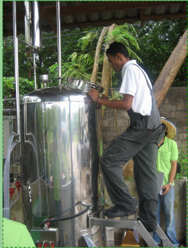
After demonstration, we operate ourselves

expected to replace all of the resort's diesel consumption. By doing so, the resort will reduce its greenhouse gas emissions by 220 tonnes per year or 5 percent of total emissions.