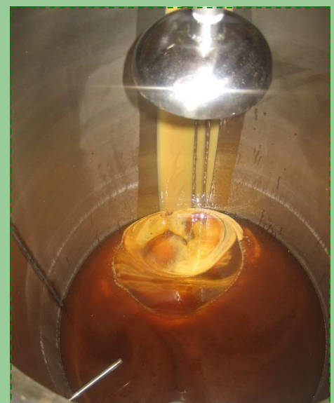
Filtrated Used cooking oil ready to be biodiesel