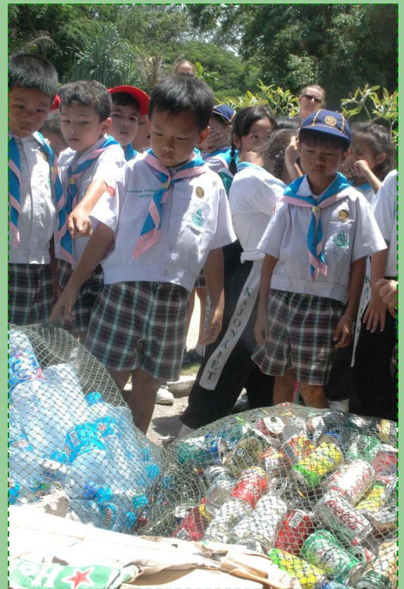
Recyclable wastes separated for recycling