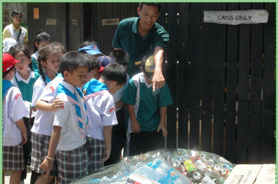
Environment Officer showed how to separate wastes