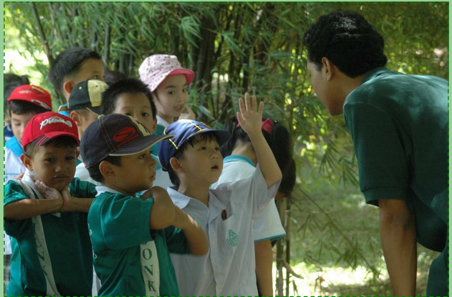
6 years old student was asking to Environment Officer

The school children and the teachers were shown the Herb and Vegetable Garden, waste water treatment plant, water reservoir, Recycling Corner, chipping machine, composting facility and nursery. The children were amazed by all the waste and how it could be separated for recycling. Particularly the smell from separated kitchen waste made many frown. It also made them real-