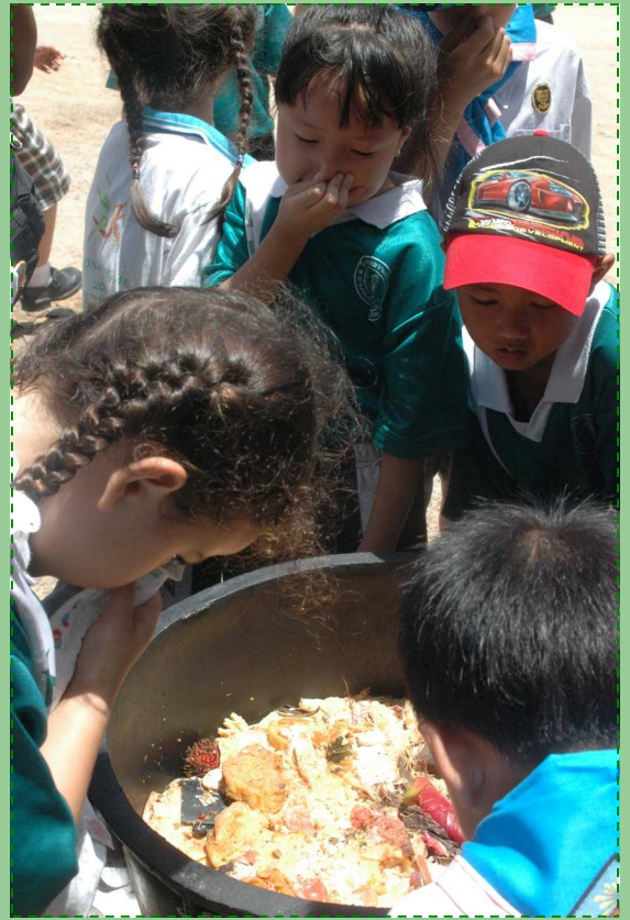
Food waste for composting

Evason Phuket & Six Senses Spa hopes the children can take the knowledge with them and adopt it both at their school and at home.