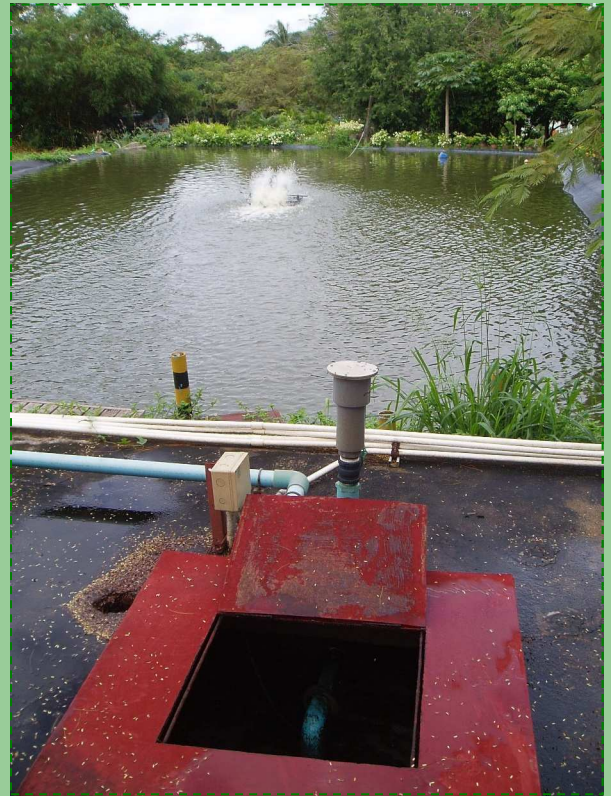
On-site wastewater Treatment Plant

In fact, the resort has gone further than just reducing consumption as it acquired a separate piece of land opposite the Phuket Seashell Museum, which has been turned into a reservoir. Rainwater is collected making the resort self-sufficient with water all year round. The water is treated to make it suitable for showering and some water is further treated through reverse osmosis. This water contains added minerals and is used as complimentary water for guests. A small desalination plant on Bon Island, the resorts private island, also ensures that fresh water can be enjoyed there.