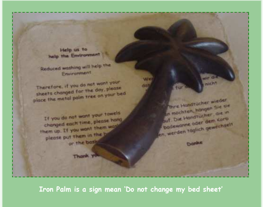
Iron Palm is a sign mean 'Do not change my bed sheet'

Despite a lot of annual rainfall, Phuket Island experiences water shortages as most of the water is in private hands and not in the governmental distribution system. The high demand from tourism puts a serious strain on the resource, particularly during the dry season. Furthermore, waste water is a concern in that it may cause pollution, particularly to the fragile marine life. Much of the sewage on the island goes straight in the ocean without any form of treatment.