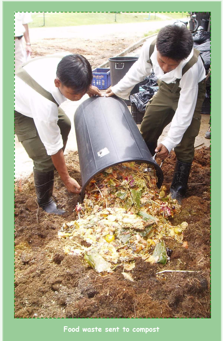
Food waste sent to compost

Part of the garden waste is shredded with the resort's chipping machine and placed directly back in the garden around footpaths as mulch. It serves as great nutrition for the plants and reduces weed growth.