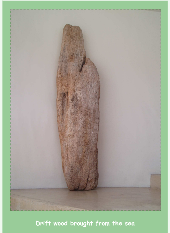
Drift wood brought from the sea