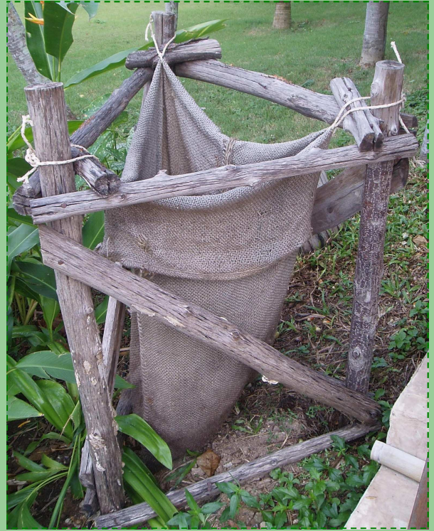
Garbage bag made from potato sac

However, no matter how much is reduced and reused waste is a fact of life. For this reason, a Recycling Corner has been established where waste is separated for recycling, such as paper and cardboard, plastics, metal, ceramic and cooking oil. A composting facility has also been established to handle organic kitchen and garden waste. As an end result, rich