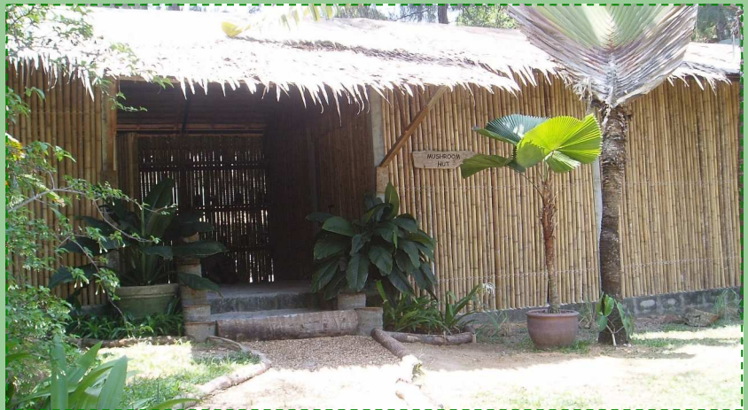
Mushroom hut at Evason Phuket