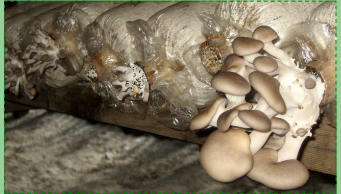
Mushroom are growing up in saw dust