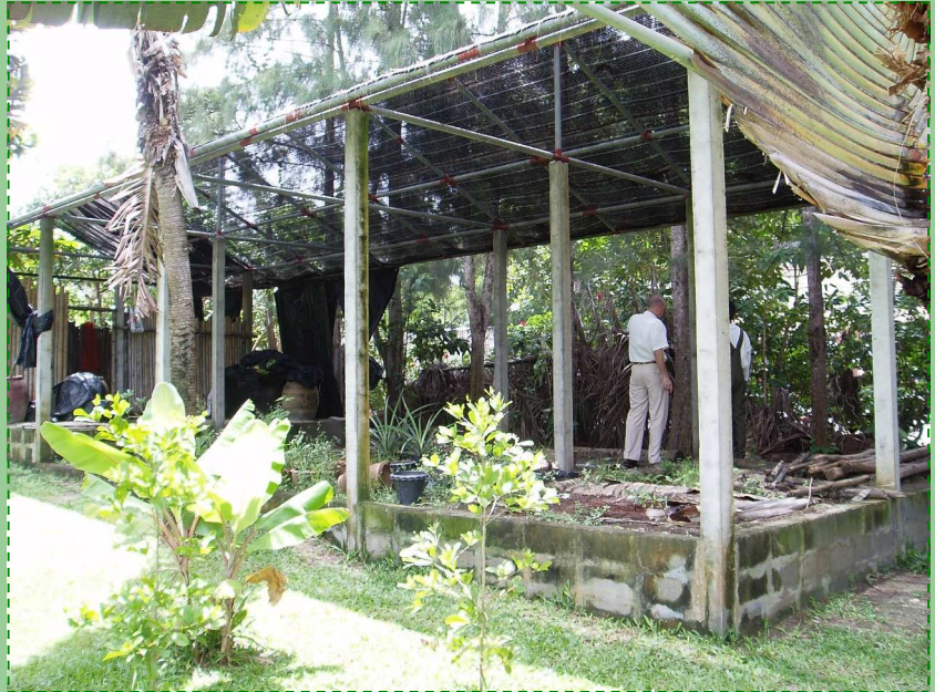
Mushroom hut build from existing structure

Initially Abalone mushrooms were grown but later Black Oyster, White Oyster and Jew's Ear mushrooms were added. The mushroom spores are placed in bags, which are left standing for a couple of months. The bags are laid down vertically when the spores change colour from brown to white. The cap is then opened for the mushrooms to grow.