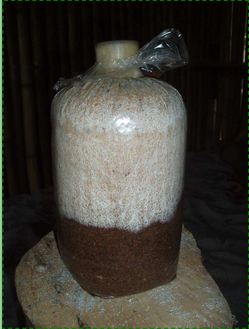
Mushroom spores growing in saw dust