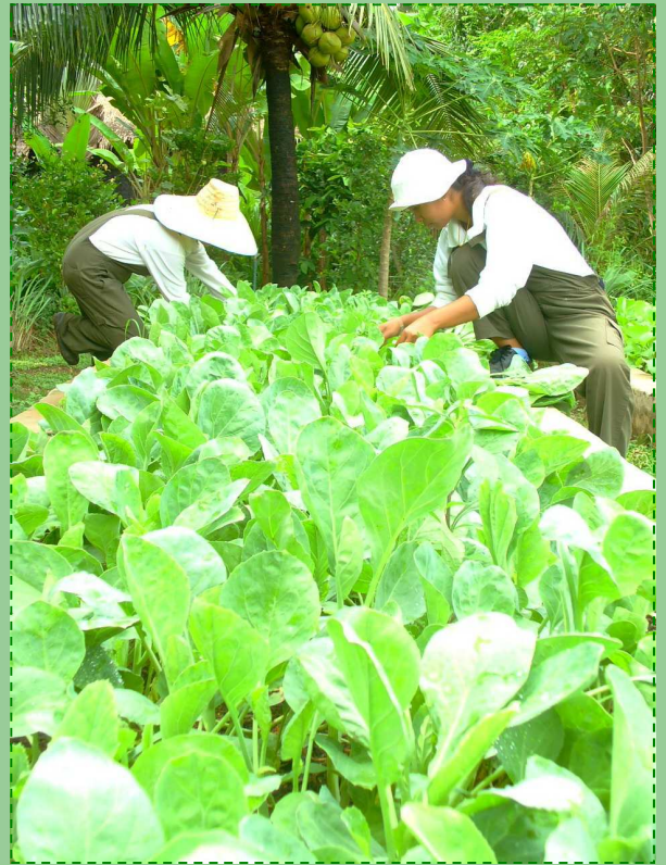
Herb and vegetable garden at Evason Phuket

The resort's private beach at Bon Island is surrounded by a beautiful biologically diverse coral reef, while the island itself is also home to numerous animal and plant species. The coral reef is protected through zoning but guest can enjoy snorkelling during high tide. However, it is important that guests enjoying the beach and water refrain from touching and stepping on the corals as well as feeding the fish.