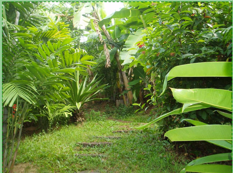
Natural looking garden