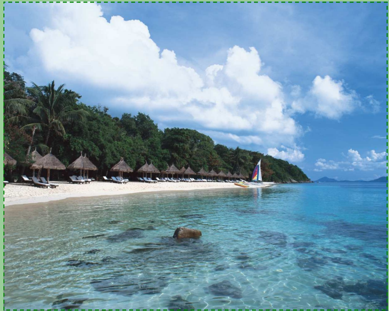
Bon Island coral preservation