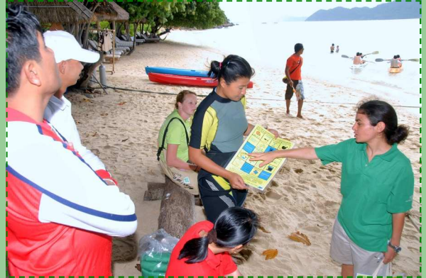
A Trainer from PMBC joined together