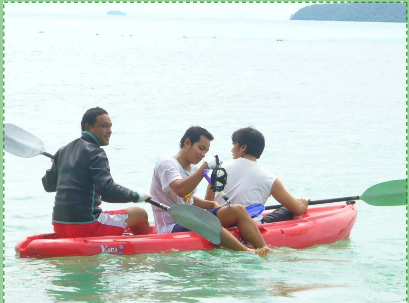
Another team on the boat