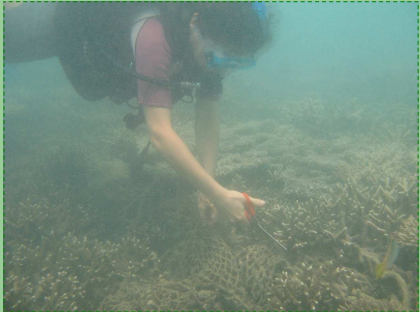
Fishing nets must be take away gently

Both hosts and guests joined the reef clean up in conjunction with professional help from the Phuket Marine Biological Centre, Green Fins and Poseidon Dive Centre. Everybody was provided with gloves, scissors and nets to collect the garbage. A briefing about the reasons of the reef clean-up and the process was given before starting the