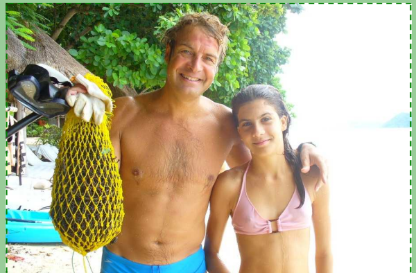
Guests and garbage collected