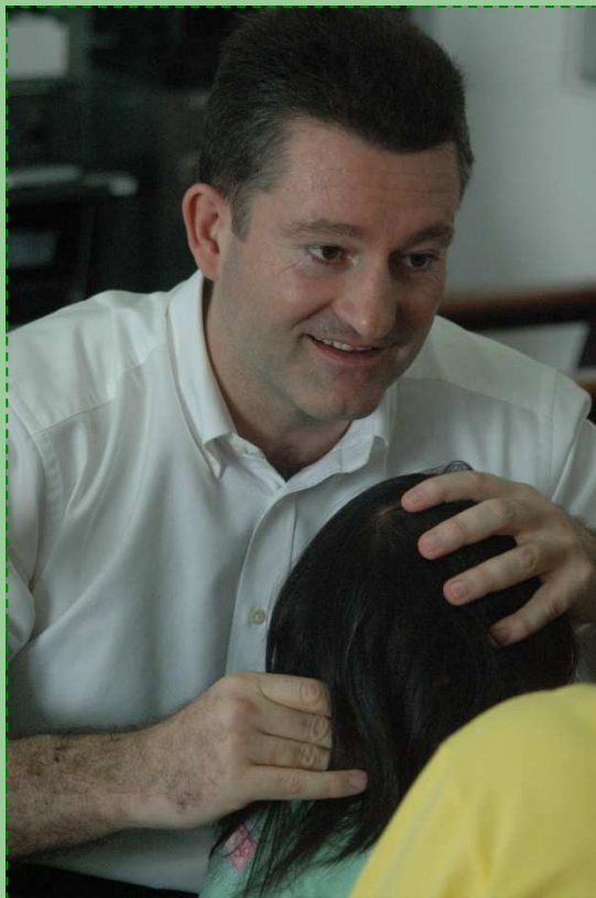
Treatments with parents' understanding