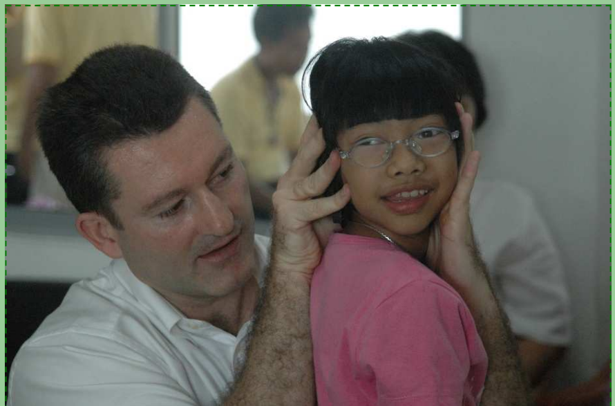
Chiropractic is effective to neurologically based symptoms only