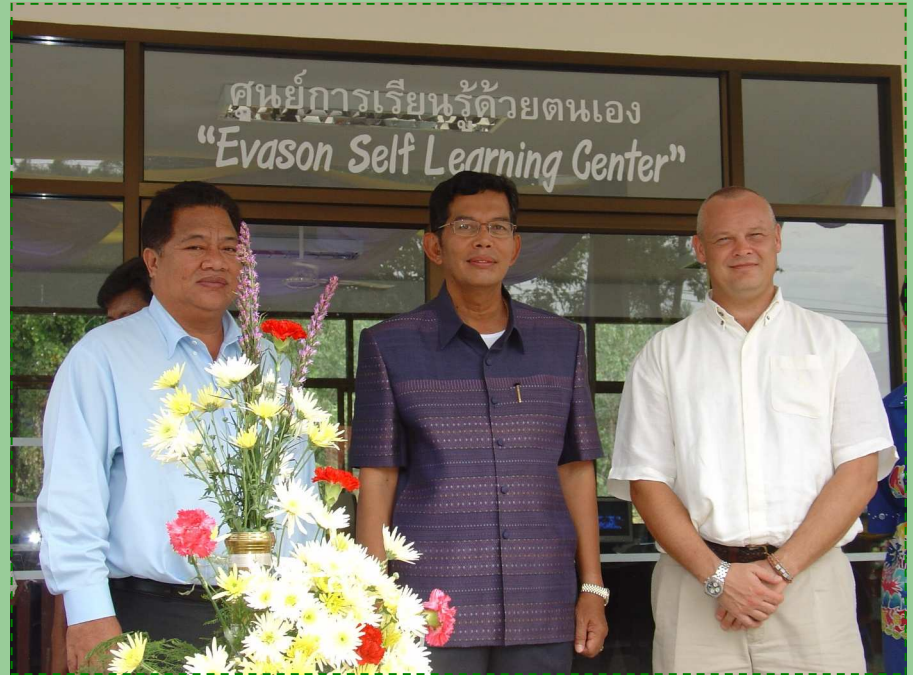
Evason Self Learning Centre at Ban Bangmuang School, Khao Lak

Evason Phuket & Six Senses Spa would like to thank all our hosts and guests for their efforts as well as all donors contributing to our relief efforts. Your help was very much appreciated.