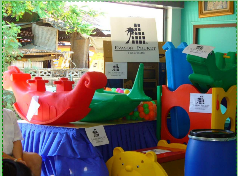
Playing equipment for their new playground

It is Evason Phuket & Six Senses Spa's pleasure to support the resort's local school and to improve their knowledge, playing areas and learning materials.