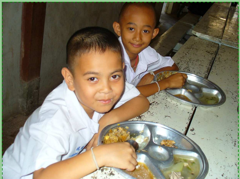
Real smile from students