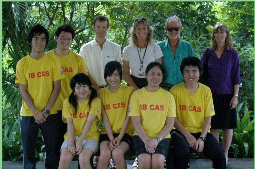
Visitors from British International School

The students hope to take some of the ideas and knowledge gained from this trip to set up their own waste management