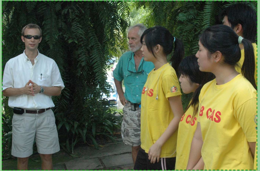
Natural look garden is more attractive

Evason Phuket & Six Senses Spa is happy to see that fellow Phuket citizens would like to adapt a sound waste management system and wish them good luck.