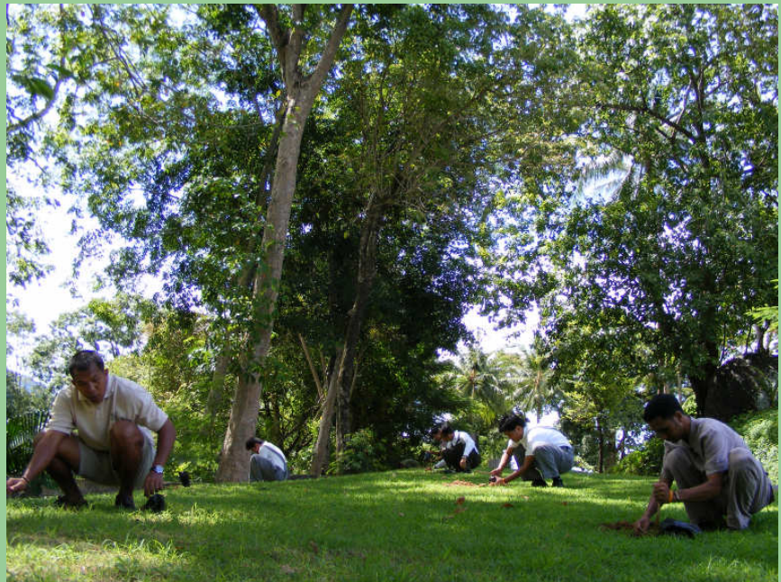
We are making the new generation of shades