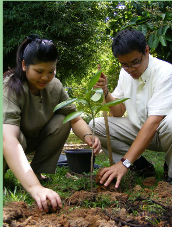
Calophyllum guttiferæ saplings

ing biodiversity, preventing soil erosion, and providing shade from the tropical sun for everyone! Another activity asked hosts and guests to switch off air conditioning and appliances between 8pm to 9pm. The objective was not only to save energy, but to raise awareness that the ability to save the environment is in our hands. Even though the total energy saved may be relatively low, the awareness raised from the activity is considerable.