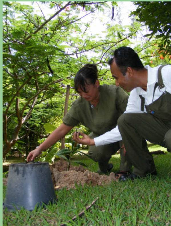
Oops! I found earthworm in the soil