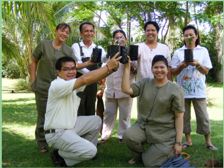
Our hosts with the saplings

The saplings are not only planted, but also cared for until they are large enough. Therefore, the expected survival rate is 100%. The saplings provide benefits including absorbing carbon dioxide emissions, maintain-