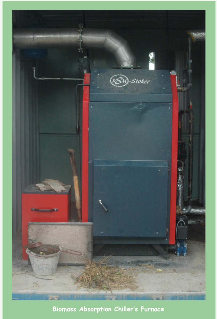
Biomass Absorption Chiller's Furnace

The biomass absorption chiller is the first commercial application of its kind installed in Thailand. It is a relatively old technology, but due to low oil prices it has never been made a commercially viable option. With increasing oil prices, the commercial value of the technology has increased.