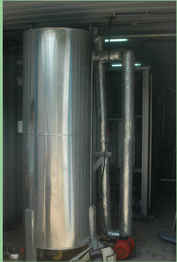
The Chiller, which create air-condition

Return on investment for the clean technology is less than 3 years for the USD 115,000 investment. The resort improves their carbon emissions with 300 ton per year.