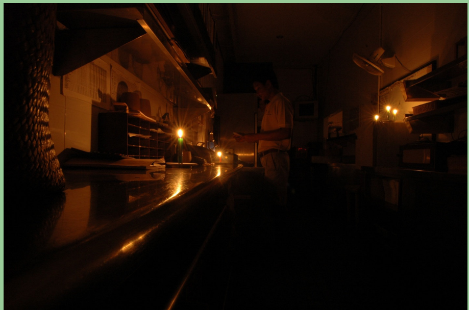
Into the Room serviced in the candle light