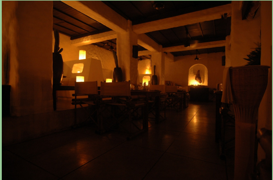
Into the Med with romantic atmosphere

initiated by World Wildlife Fund in which hundreds of millions of people around the world come together to demonstrate their concern about climate change. The lights-out initiative now reaches out to more than 4,000 cities and towns in 88 countries around the world and demonstrates that by working together, each person can make a difference in the fight against climate change.