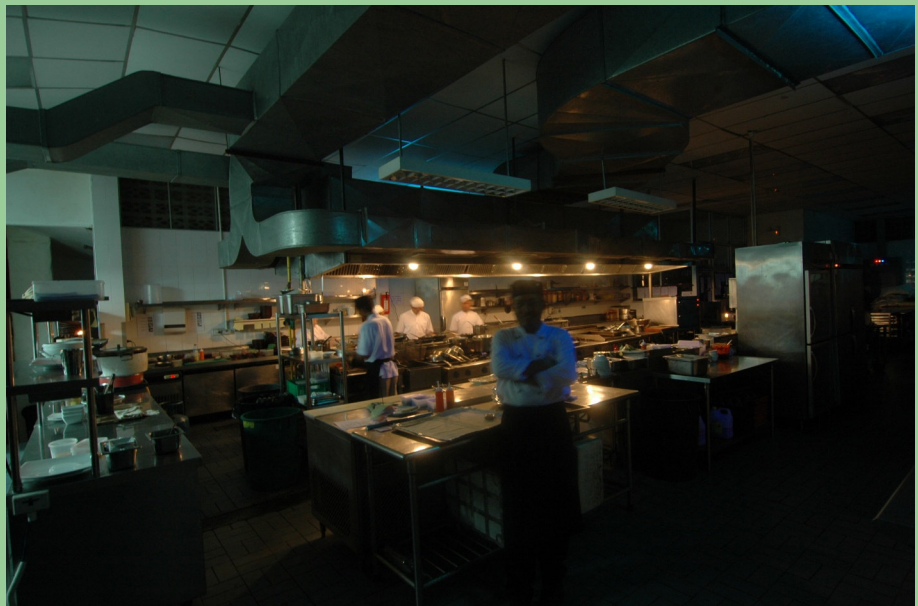
Main Kitchen with lights on demand