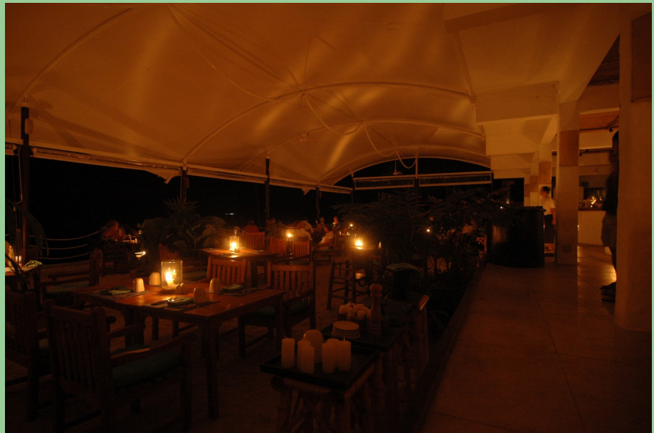
Into the Beach during Earth Hour 2009