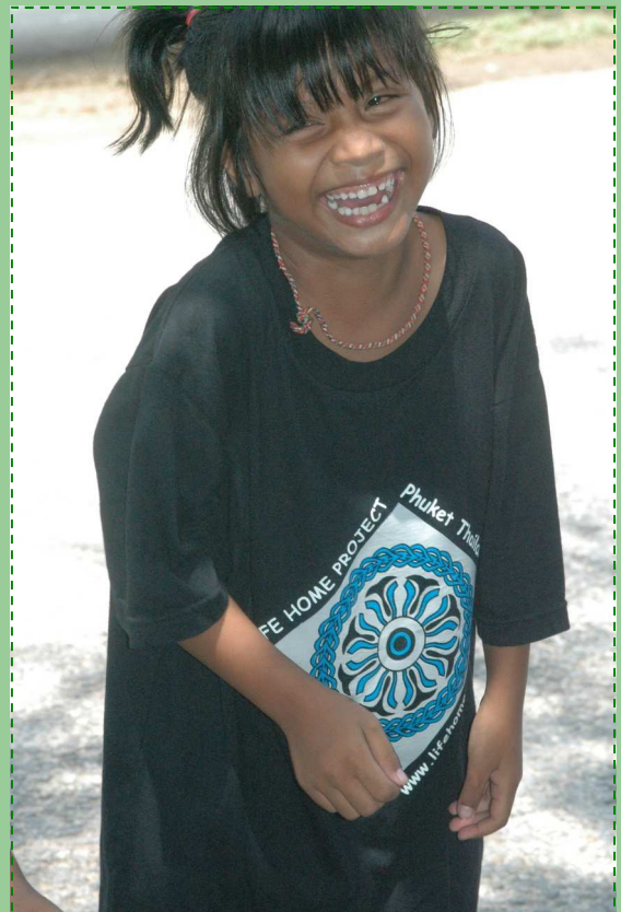
Smile from delighted experience