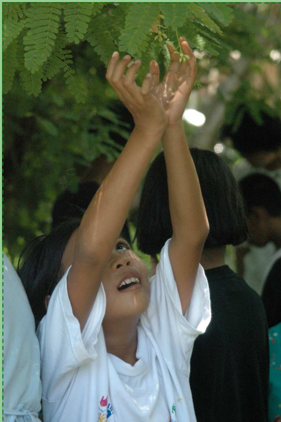
Everything are strange for children