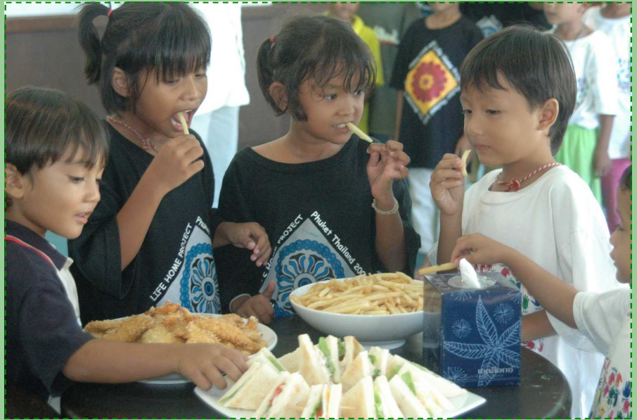
First impression from western food

Evason Phuket & Six Senses Spa has for several years supported Life Home Project Foundation, which predominantly is a shelter for women with HIV and their children. However, the foundation also takes care of underprivileged children and poor families.