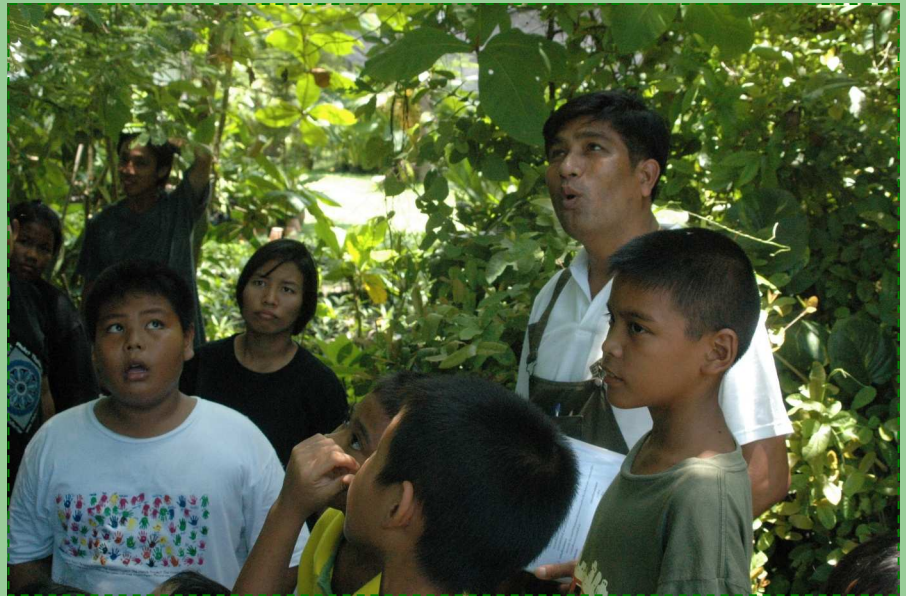
Children from Life Home Project are learning about natural surroundings

Through various activities the children and adults were shown the Herb and Vegetable Garden, waste water treatment plant, water reservoir, Recycling Corner, chipping machine, composting facility and nursery. Following the outdoor activities the children were taken to Just Kids! Club where they could play as well as learn about banana leaf folding. The highlight was the snack time where the children tasted western