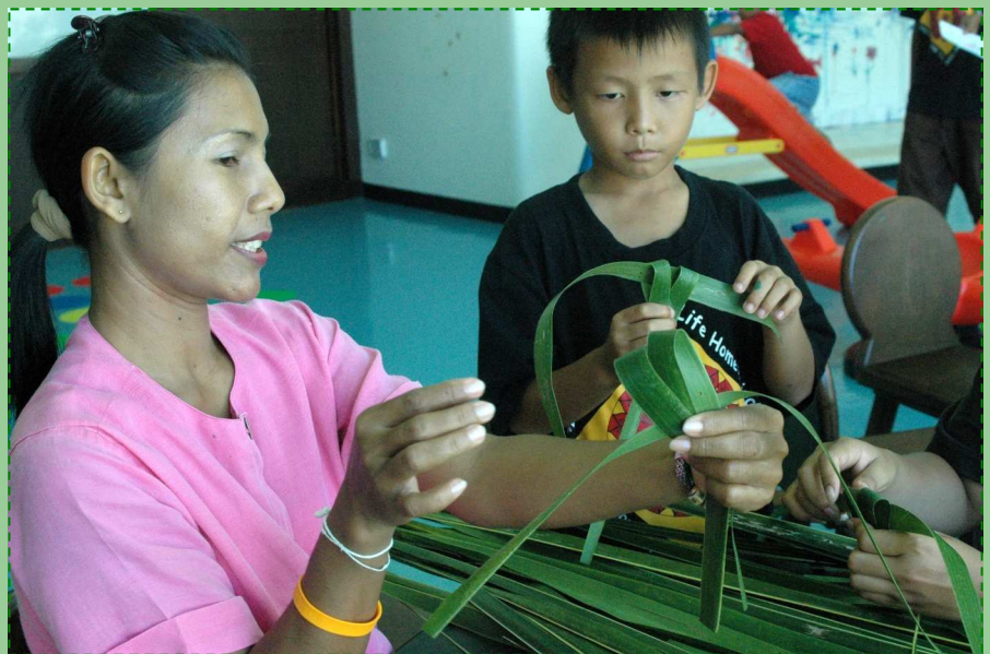
Children are learning how to make a fish from palm leaf