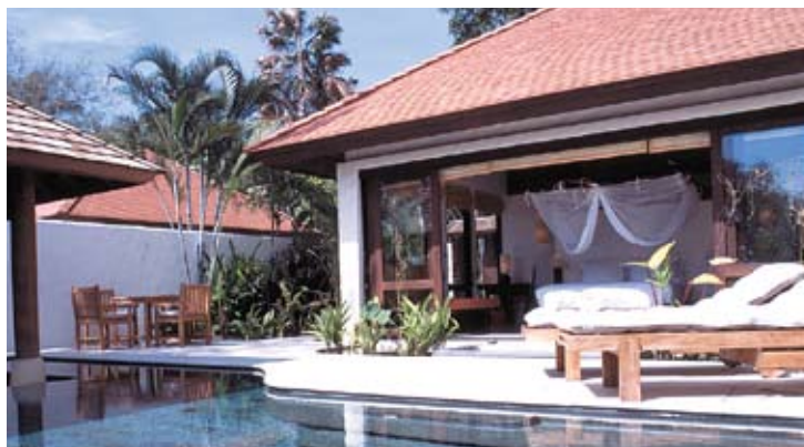
Evason Pool Villa

Wi-Fi is also available at Into Pondering and Into The Beach.