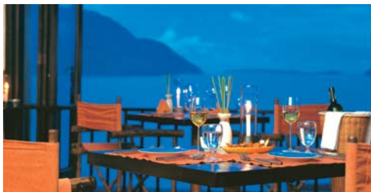
Into The View

Location: Upper seaside level, accessible by the road Opening Hours: 6:00 AM – 10.30 PM (closed for lunch)