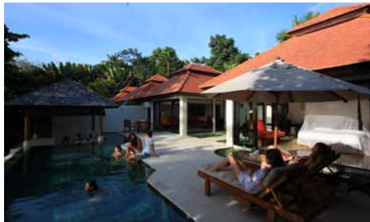
Evason Pool Villa

The new sundeck wing has become a resort within a resort. It comprises 21 Duplex Pool Suites, Family Pool Suites and 17 Junior Suites, with spectacular views from all suites, plus butler service. It is ideal for families, friends and couples alike. The wing has its own reception, business centre and library with computers. Internet wireless connection is free of charge for those with their own laptops. There is a fitness centre, steam room and sauna, pool bar and café, and Just Kids' – a club for youngsters. Into Games is great for teenagers, with a pool table, table tennis, football tables, play station and other games.