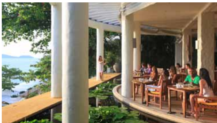
Into The View

Location: On the beach, lower seaside level Opening Hours: 11:00 AM – 10:30 PM (restaurant) 1:00 AM (bar)