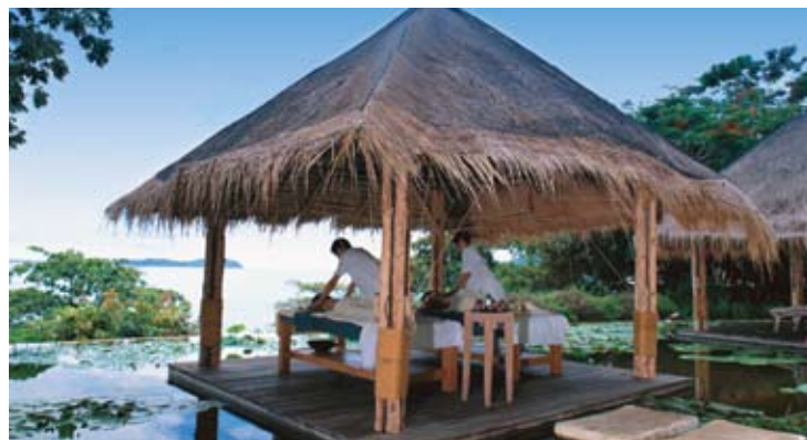
Six Senses Spa

Our luxuriously appointed Six Senses Spa spreads over three floors and sets new standards in spa design. Facilities include 6 single treatment rooms, 2 saunas, 2 steam rooms and 3 double treatment rooms featuring outdoor baths for couples and friends to enjoy. An additional 4 treatment rooms are located in the salas on the spa terrace overlooking the Andaman Sea.