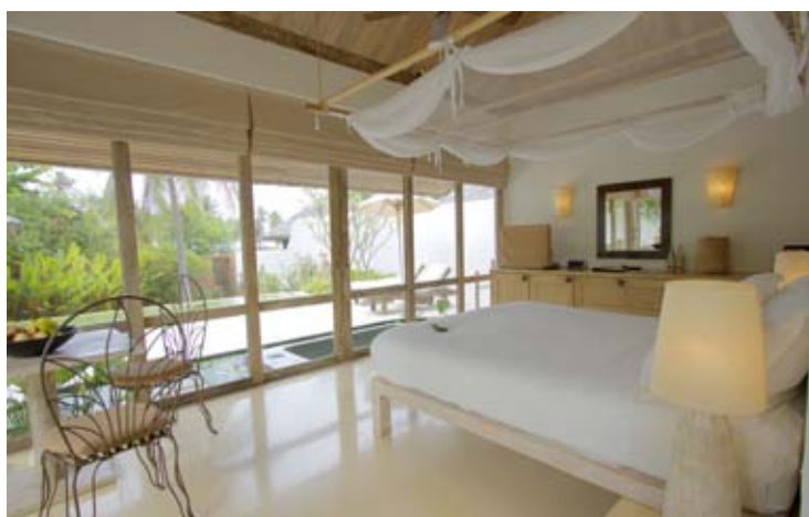
Six Senses Pool Villa

Each villa is surrounded by a mudwall for privacy and has its own private pool, outdoor bath and beautifully landscaped garden, offering both spacious and luxurious living conditions.