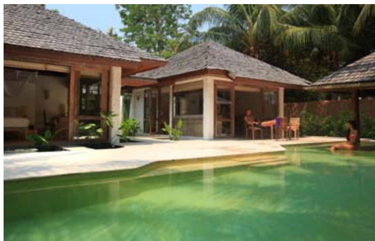
Pool Villa Suite