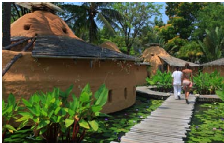
Six Senses Earth Spa at Hua Hin