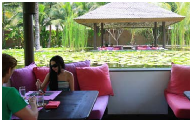
Living Room Restaurant - Sunken Sala

Six Senses Earth Spa at Hua Hin offers a comprehensive menu of specialty treatments that focus on Skin Food – the commitment that nothing should be put onto the skin that could not be eaten. In balance to these elements are philosophies of traditional medicine, such as Ayurveda and Chinese. Many of the ingredients used in the treatments are grown right at the Six Senses. These include rice, coconut, avocado, papaya, lime, aloe vera, cucumber, pandanus leaf, lemongrass, ginger, galangal, candlenut and turmeric and all freshly harvested.