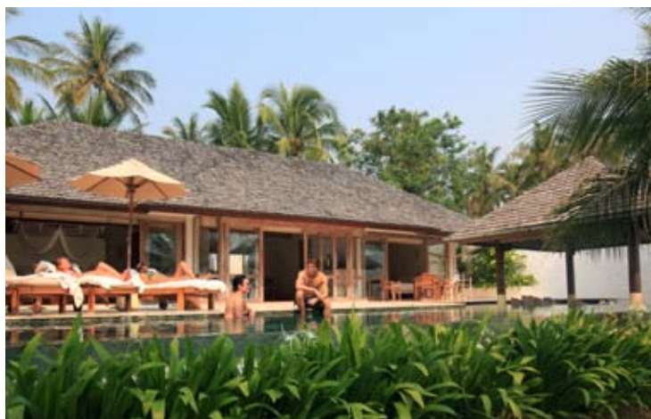
2 Bedroom Seaview Pool Villa Suite