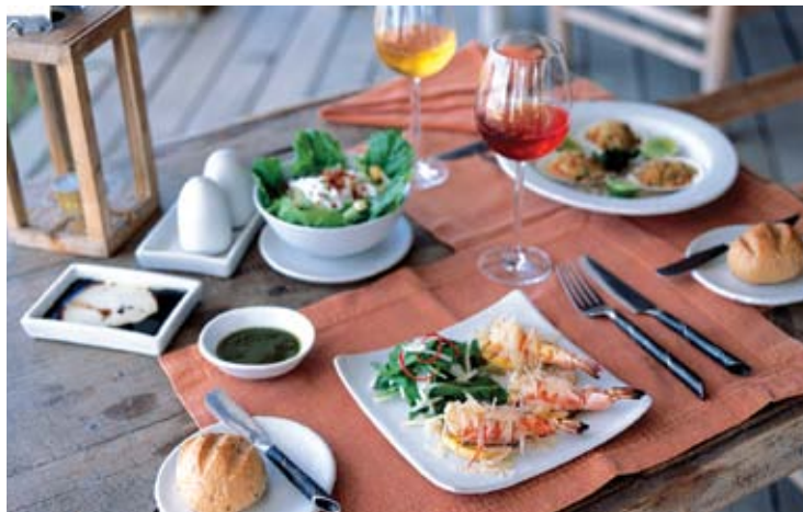
The Beach Restaurant

romantic, private and unique. Breakfast in the living room of your villa, or lunch al fresco over at the Beach Restaurant – the settings are as memorable as the cuisine.