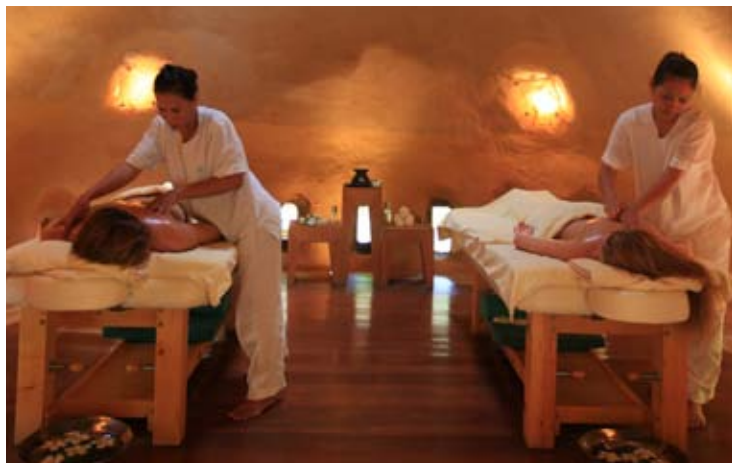
Six Senses Earth Spa at Hua Hin - Treatment Room