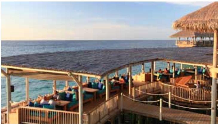
Chill Lounge and Bar