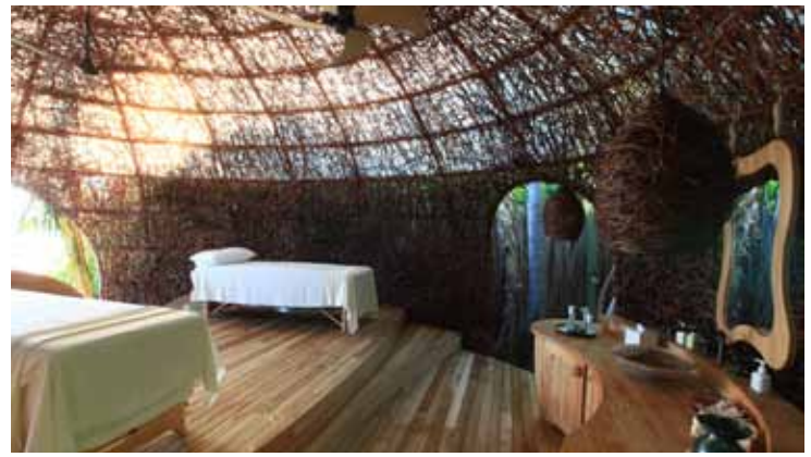
Six Senses Spa

Sitting on the beach, the Six Senses Spa offers five secluded treatment