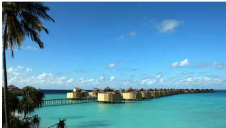
Six Senses Laamu