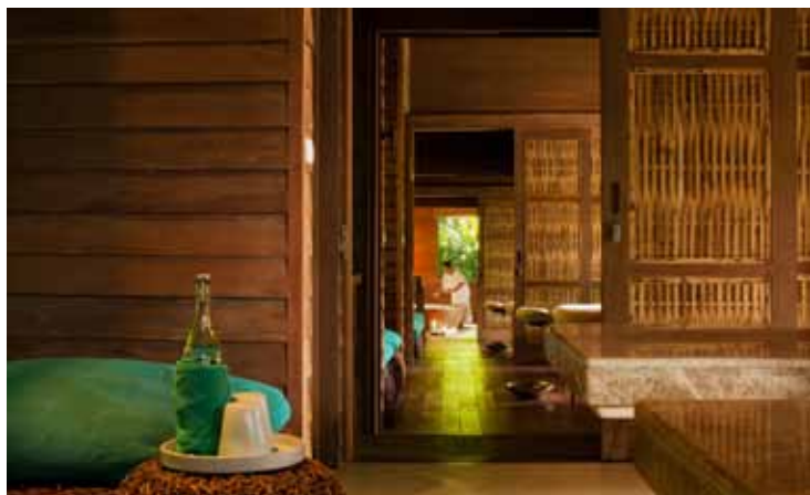
Spa Long House

Private in-villa or terrace dining compliments the secluded peaceful atmosphere. For the true romantic, the villa butler will arrange for a champagne breakfast, a private picnic or an evening barbecue beneath the stars, with a personal chef and waiter at the ready.