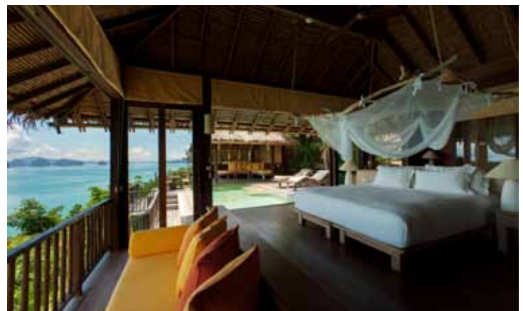
Ocean Panorama Pool Villa