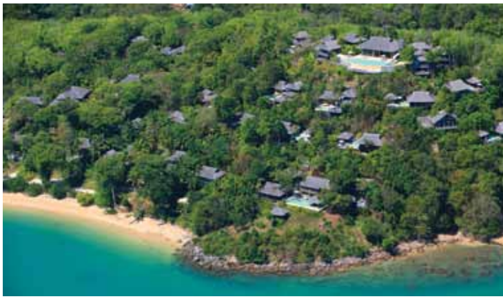
Six Senses Yao Noi