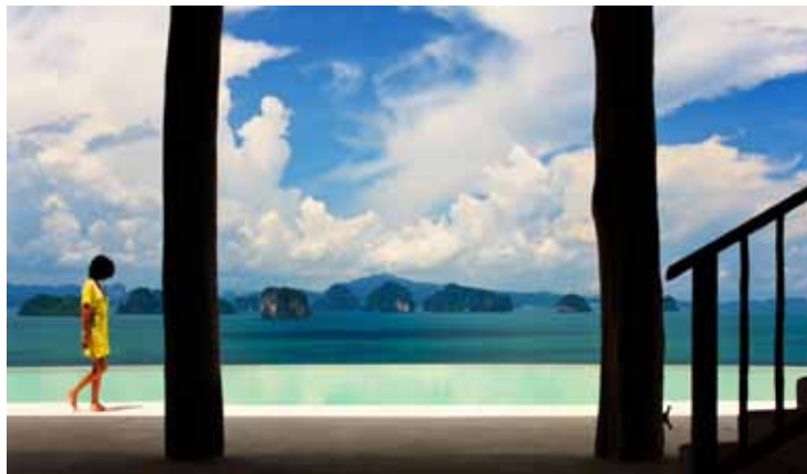
The Hilltop Reserve