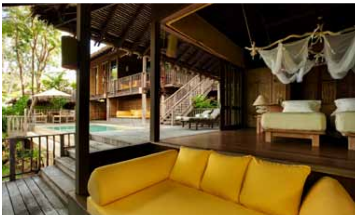
Ocean Two Bedroom Pool Villa

* SUSTAINABLE - LOCAL - ORGANIC - WELLNESS LEARNING - INSPIRING - FUN - EXPERIENCES