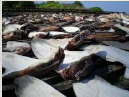
Kulhudhufushi, Haa Dhaal Atoll