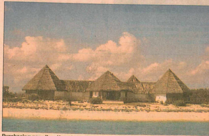
Purchasing paradise: Kamalame Cay, a private island in the Bahamas

Jets, which offers fractional aircraft ownership, has seen unprecedented growth in the past five years. "First, this is due to the boom in the economy," he says. "Second, because people hate airports and want privacy and exclusivity in their flying that commercial airlines can't give them."