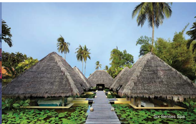
Six Senses Spa