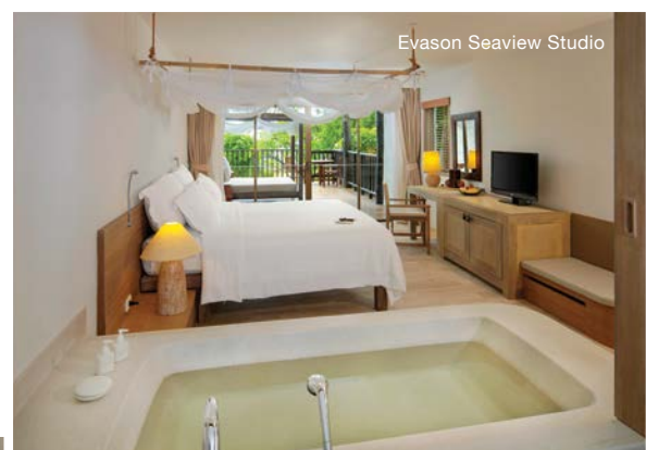
Evason Seaview Studio