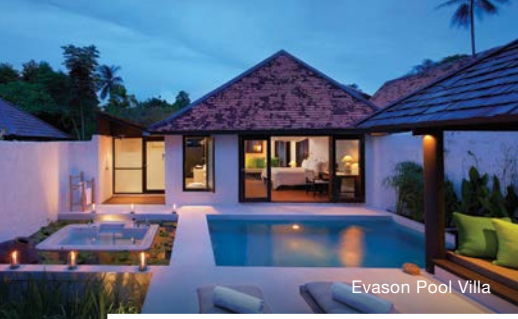
Evason Pool Villa