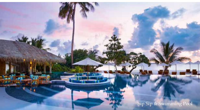
Sip Sip & Swimming Pool

Six Senses Spa offers nine private treatment nests, either with an ocean view or tucked away in the lush nature that surrounds them. Awaken the senses with locally inspired and Ayurvedic treatments, massages, yoga and fitness classes or workshops. Highly skilled Six Senses Spa therapists use a synergy of natural products to provide a comprehensive range of award-winning signature procedures and journeys, plus rejuvenation and wellness specialties of the region. Visiting practitioners offer guests lifestyle consultations and using the results of a non-invasive health screening, our experts craft a specialized holistic wellness program for each individual.