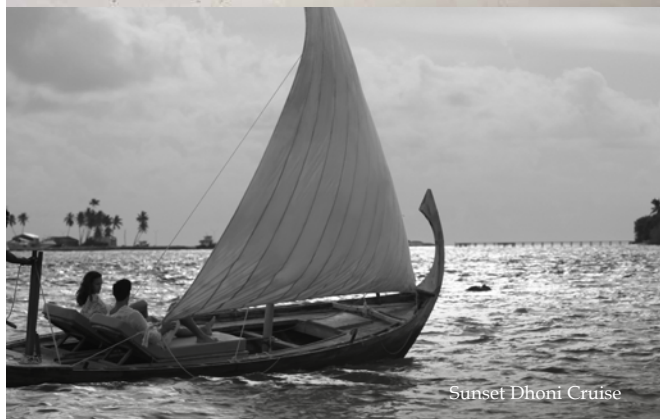
Sunset Dhoni Cruise